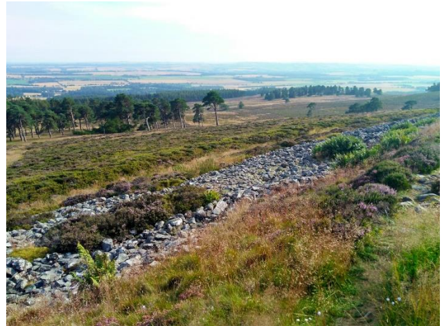
Image 2: Stone rampart and ditch formation on the White Caterthun, view to the South East