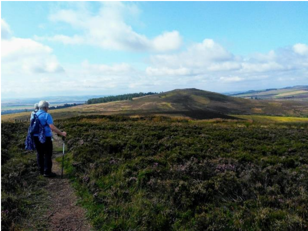
Image 1: Transect walk on the Brown Caterthun, looking towards the White Caterthun

Full acknowledgement and grateful thanks are given to all the individuals who participated in this study.