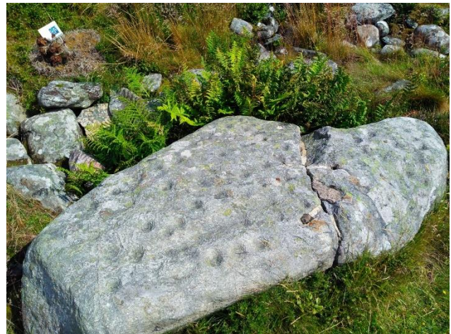
Image 4: Cup-marked stone on West side of the White Caterthun. 1 Top left is the remains of a wreath and card and to the right is a patch of burned ground

All images taken August 2019