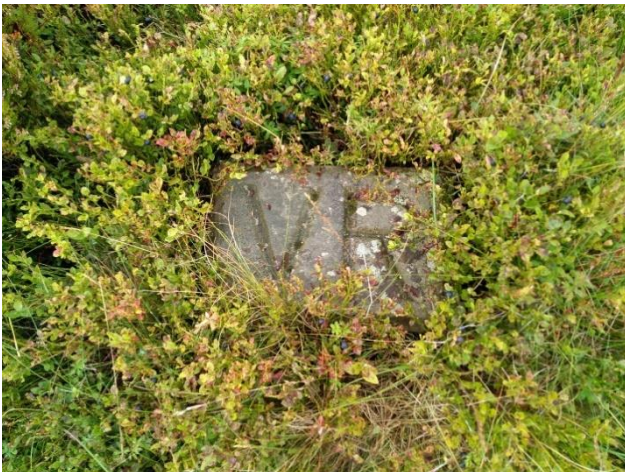
Image 3: Boundary marker on the White Caterthun surrounded by fruiting bilberry bushes. Marked VR, the markers were installed in 1885-87.