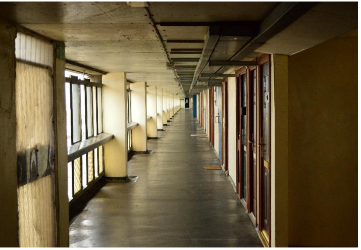
Image 2: Interior of the House, one of the three public access balconies. Responses to this photo included that it appeared 'clean', and a 'nice, warm, inviting place', which contrasted with some people's expectations and experiences