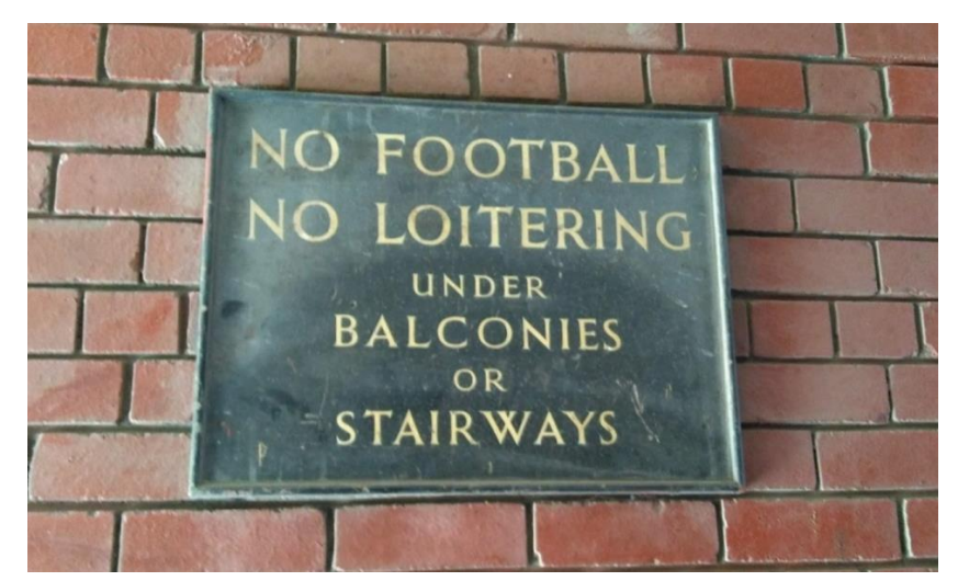
Image 4: Notice in passageway outside the main entrance to Cables Wynd House