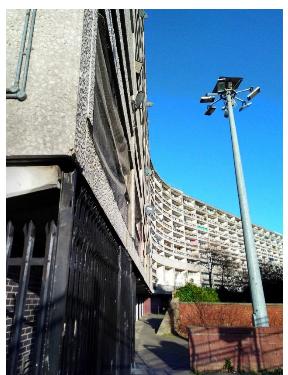
Image 1: Exterior of the House (Eastfacing/private balcony side), showing the distinctive bend

Full acknowledgement and grateful thanks are given to all the individuals who participated in this study.