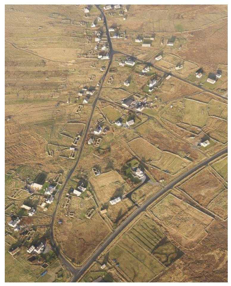
Image 4: 2011 aerial photograph of Arnol village (Canmore Catalogue Number DP 111144. © Crown Copyright: HES)

In 2016, following a prolonged period of community mobilisation and negotiation that began in 2004, the Estate that includes the village of Arnol and the associated crofting and common grazing land was successfully transferred to community ownership of The Barvas Estate Trust